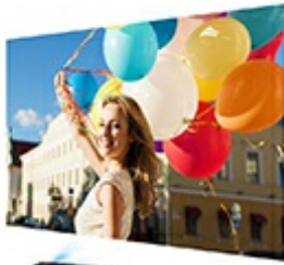
SuperColor™ projectors offer color accuracy levels