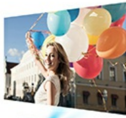
Conventional projectors offer low-quality images