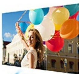
SuperColor™ projectors offer color accuracy levels