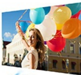
SuperColor™ projectors offer color accuracy levels