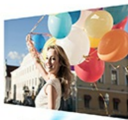
Conventional projectors offer low-quality images