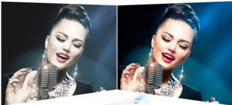
ViewMatch® Color Mode